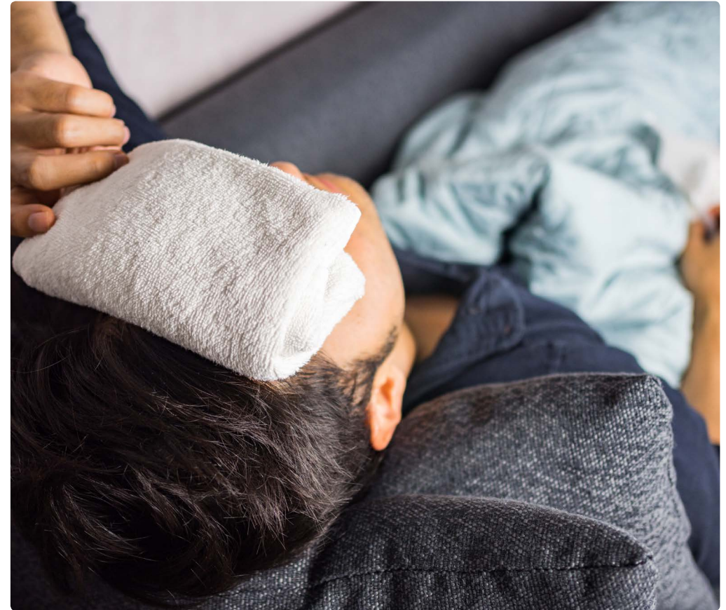
A cool flannel on the forehead is one way to help to relieve symptoms of travel sickness

Some people may wish to use homeopathic remedies for travel sickness, however, evidence for these is limited