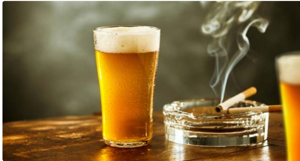
Patients should be advised on smoking cessation and reducing alcohol intake to reduce risk of complications

The pain of peripheral neuropathy is not usually alleviated with traditional painkillers, such as paracetamol. Instead, amitriptyline, duloxetine, gabapentin and pregabalin are drugs used to treat neuropathic pain.